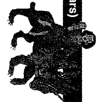
The Beast 13:1-8